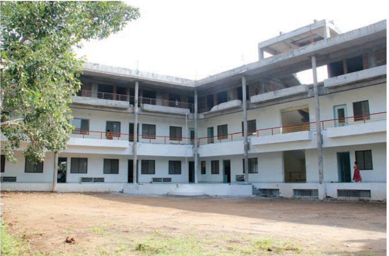
Anubhūti English Medium School-2, Jalgaon