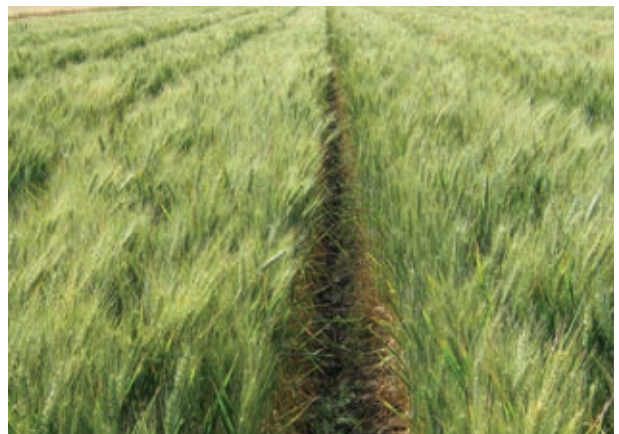
Wind : The new-found source of energy