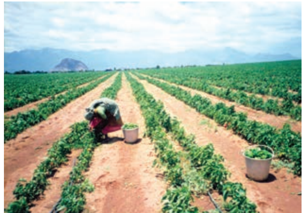
Land : The source of all food