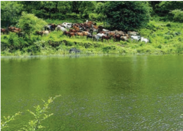
Water : The source of all life