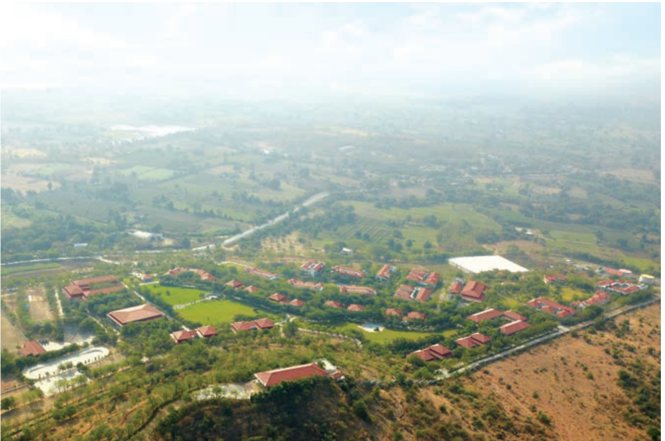
Anubhūti - The sprawling green campus - A bird's eye view