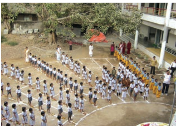
Children of Anubhūti English Medium School-2

A good part of the profit that the Corporation generates through the above activities is invested in the promotion of the cultural, educational and social lives of the community. Our